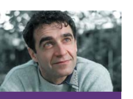
Making medical decisions for someone else — you have the special responsibility and priviledge of doing something important for another person.