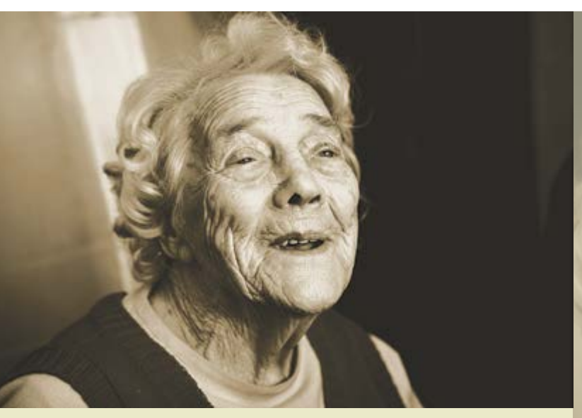
What would they want? The aim is to choose as they would probably choose, even if it is not what you would choose for yourself.